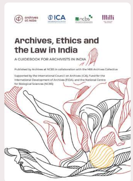
Guidebook for Archivists

Digital tools at the intersection of artificial intelligence and archives.